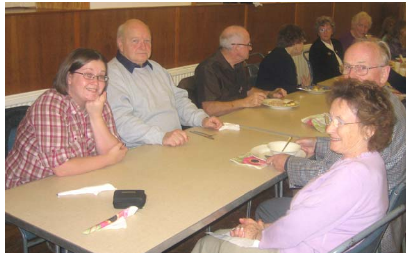
Over 50 people from the church communities in Maybole came together to share a harvest supper last Sunday. People came with their dishes and shared them with the company. The occasion, organised by Maybole Council of Churches, was enjoyed by all. One person said: "We should do this more often, whether it's harvest or not." We may just do that.