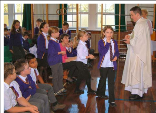
All Saint Day Mass in St Cuthbert's Primary and the many faces one family poster from by the children.