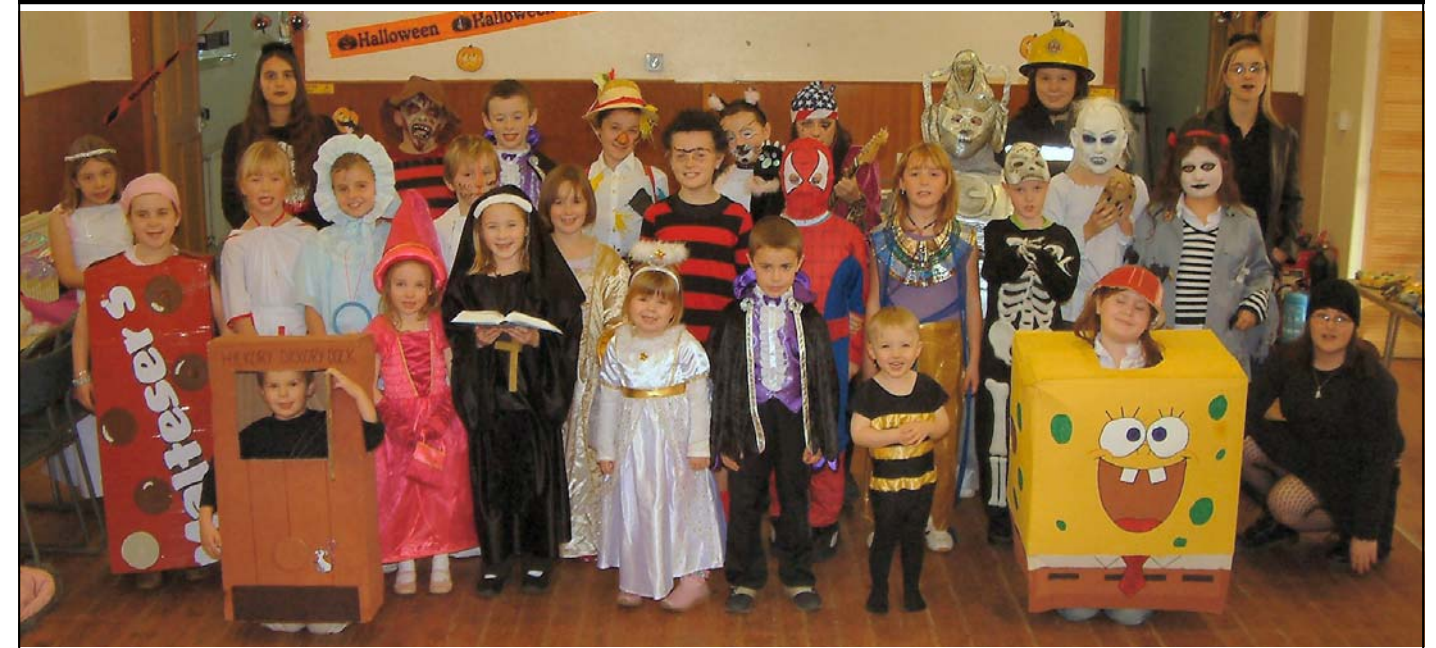
Young parishioners of Our Lady and St Cuthbert's at their Hallowe'en party last Sunday afternoon (above) with the St Cuthbert's Primary party (below).