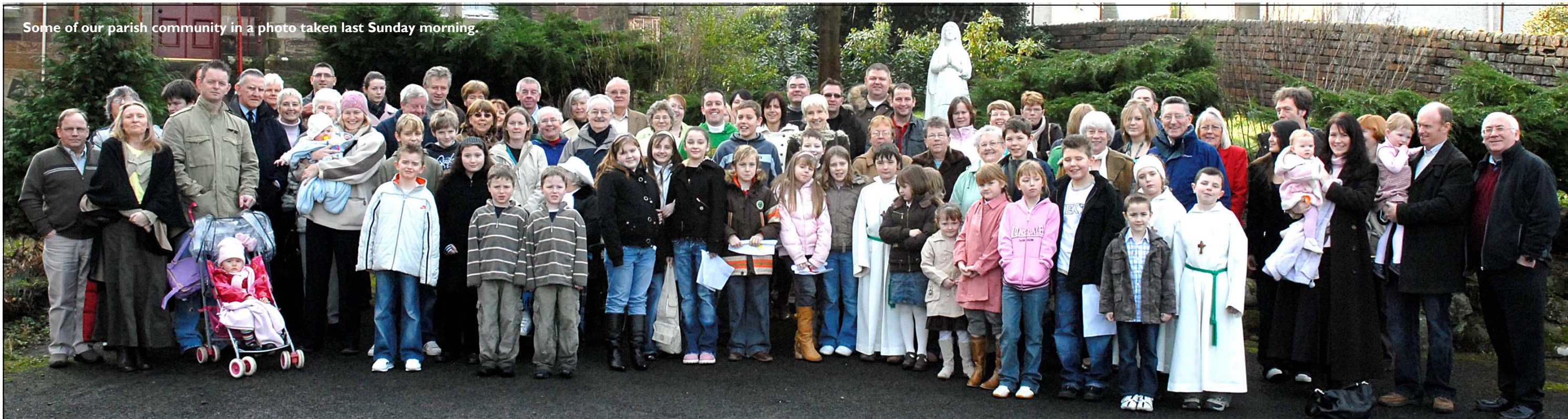
Some of our parish community in a photo taken last Sunday morning.