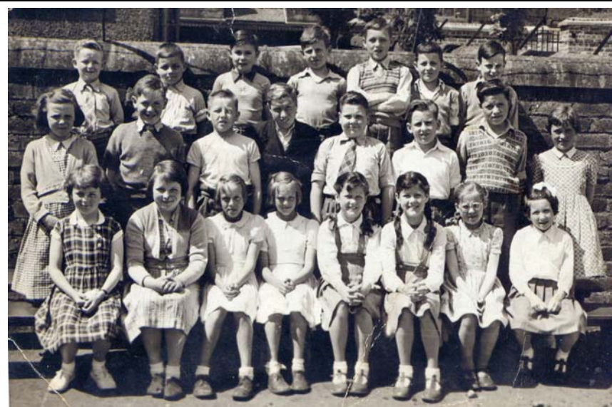
Primary 5, 6 and 7 at St Cuthbert's Primary, 1955. Do you recognise them?