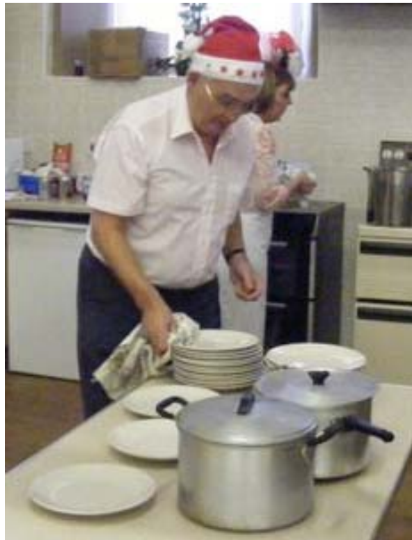
Some more going-on at the annual Christmas dinner for senior citizens are pictured here. Thanks again to all who made the day possible. Special thanks to the Fire Service for their donation, which together with that of the Police, helps cover the costs of this lunch.