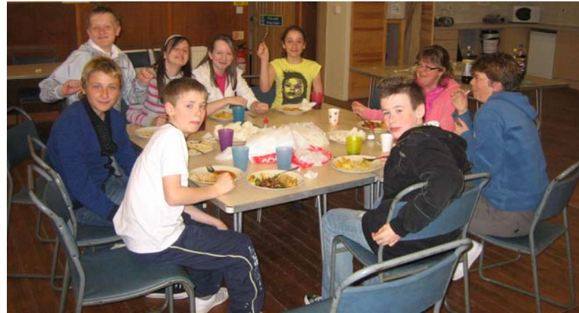
Thanks to the young parishioners who helped tidy and improve the church grounds last Saturday. After the evening Mass we enjoyed a Chinese meal together.