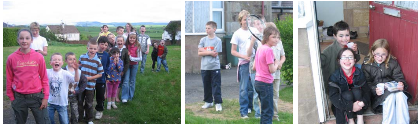
Young parishioners enjoying their barbeque and games after the Vigil Mass.