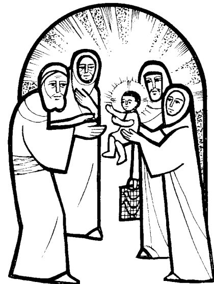
Our Lady and St Cuthbert's has permission to reproduce hymn words under licences: CCL 960699 and 960709, Calamus 1526