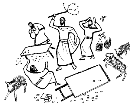
Our Lady and St Cuthbert's has permission to reproduce hymn words under licences: CCL 960699 and 960709, Calamus 1526