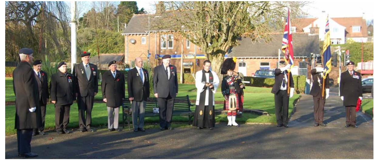
"They shall not grow old, as we that are left grow old; age shall not weary them, nor the years condemn. at the going down of the sun and in the morning we will remember them."