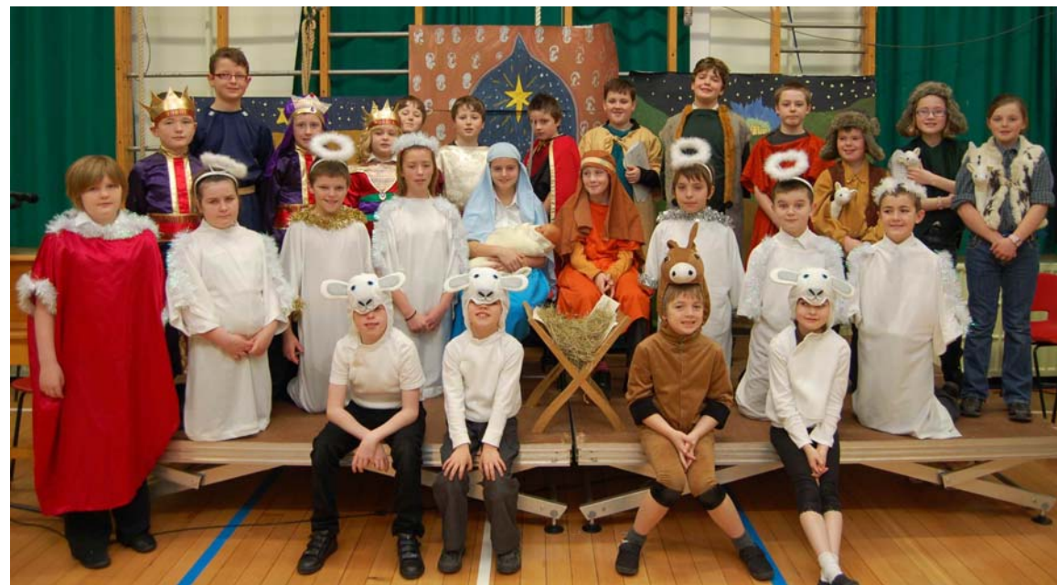
Above: St Cuthbert's Primary stages 4-7 Christmas production this year was "There's Something Amazing Going on". Family and friends of the school were able to enjoy show in the school's newly refurbished Gym Hall. It was a great success and everyone had a wonderful time.

THE LOVING ENVIRONMENT OF A FAMILY draws forth an individual's greatest talents and gifts. We've come to realise that creating an atmosphere in which children can hear the Lord's call is one of the most significant responsibilities resting on our shoulders as parents. Our own lives must reflect the presence of God, His Word, and the love He offers His people. Parents, do you encourage your children to develop their talents and gifts? Do you encourage your children to think of priesthood or religious life as a possible life choice?