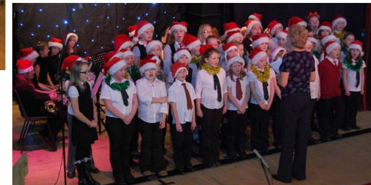
Bottom right: Children from the local primary schools sing at the Maybole Council of Churches Carol Service in the Town Hall last Tuesday. Carrick Academy brass band and teachers led the accompaniment for the other carols, and the Parish Church choir sang.