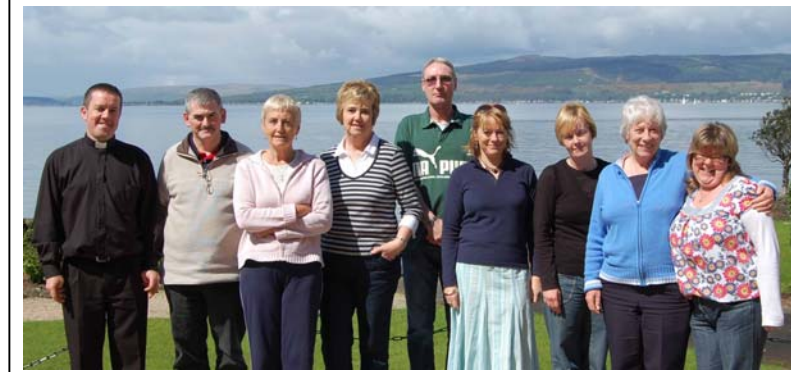
The present PPC on retreat last year

This weekend nominations will be invited for three people to stand for election to the Parish Pastoral Council for the next two years. According to the constitution, 3 people step down every year to make new opportunities for people to represent the parish in this